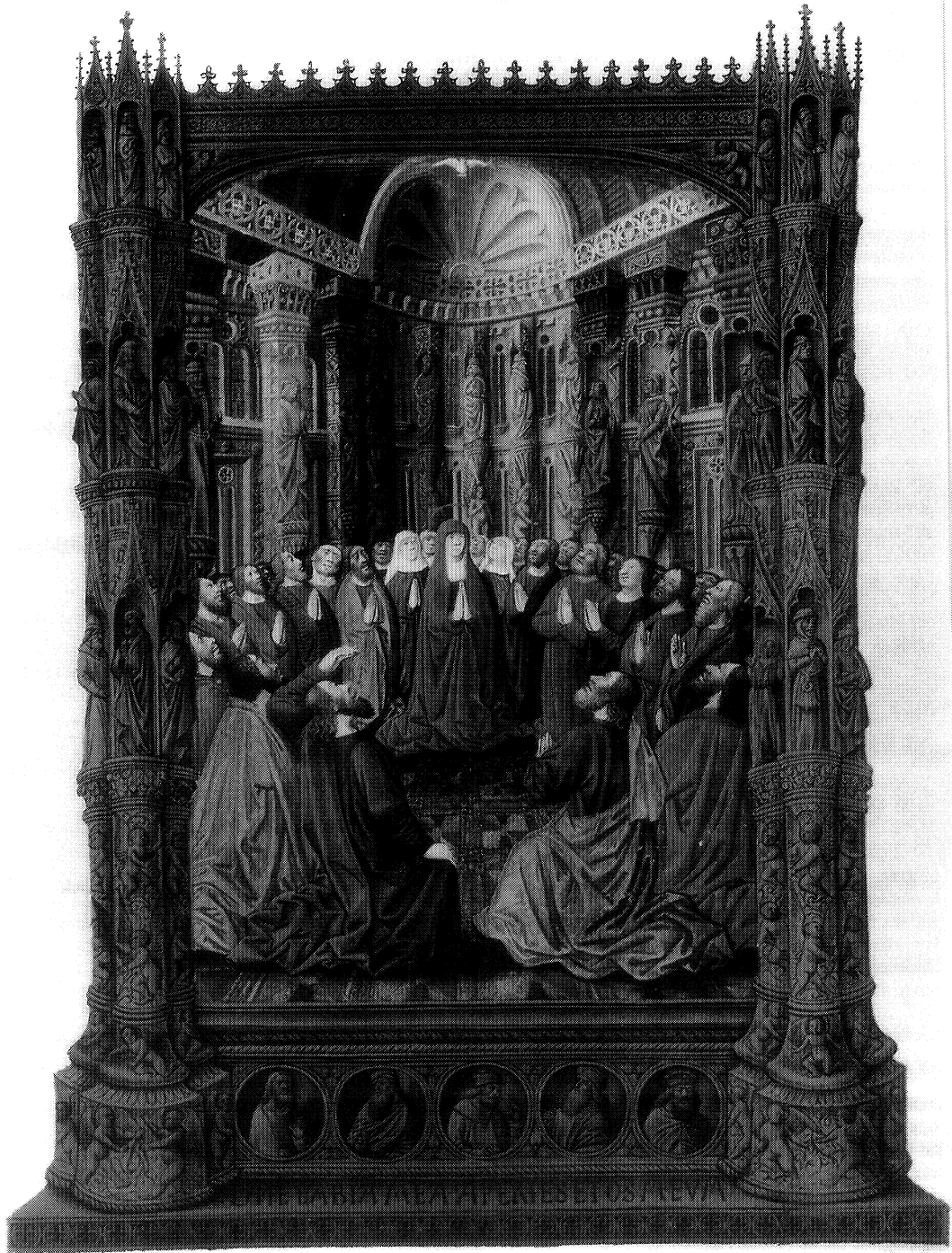
„Pfingsten“, Miniatur von Jean Colombe, um 1485